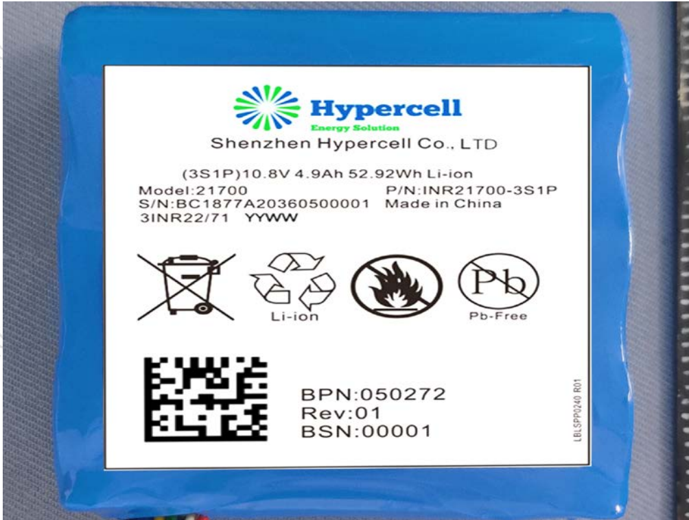
Figure 3 Battery Label