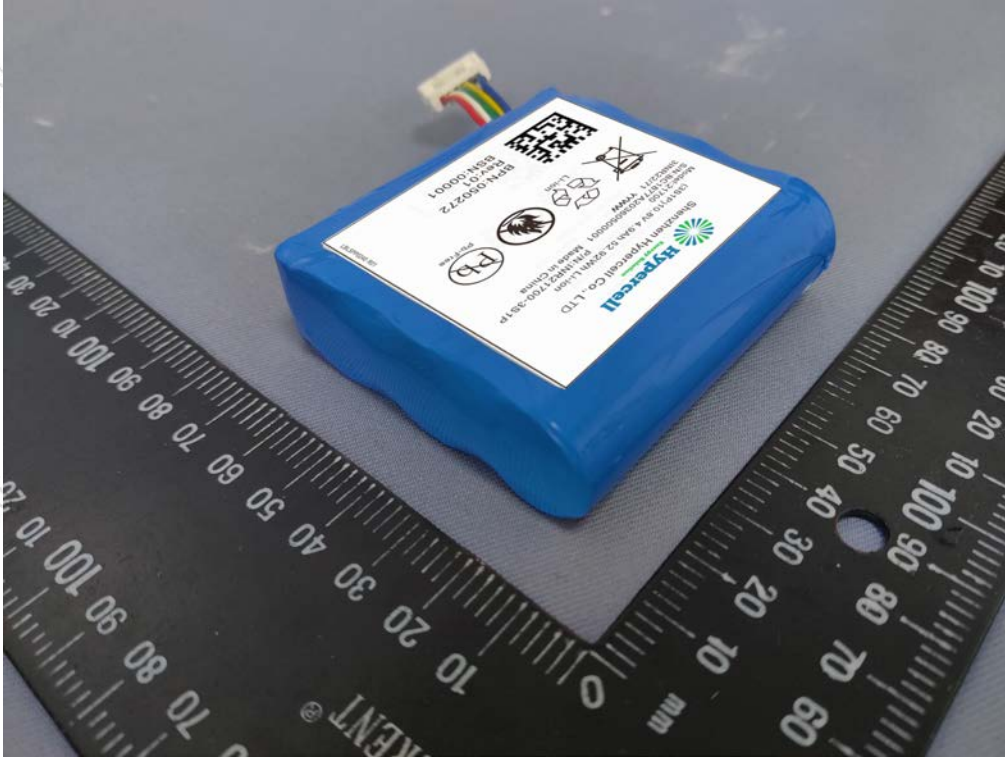
Figure 1 Overall view I of battery