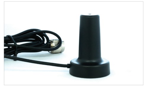
Image does not reflect the actual size of the antenna