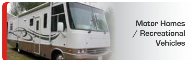
Motor Homes / Recreational Vehicles