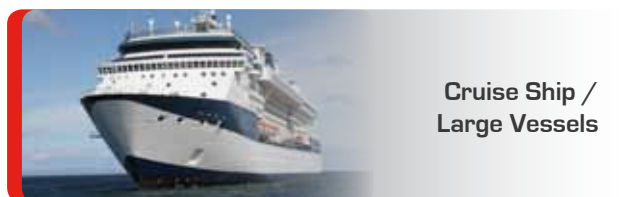
Cruise Ship / Large Vessels