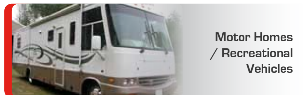
Motor Homes / Recreational Vehicles