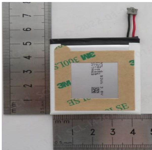
图2：反面 Figure 2: Back side