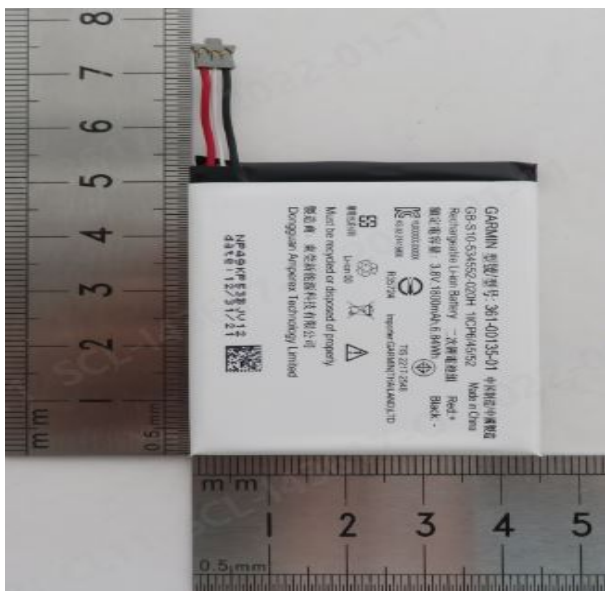
图1：正面 Figure 1: Front side