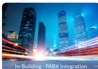
In-Building - PABX Integration