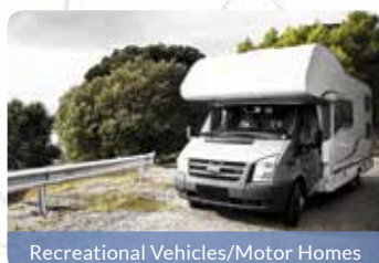
Recreational Vehicles/Motor Homes