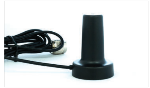
Image does not reflect the actual size of the antenna